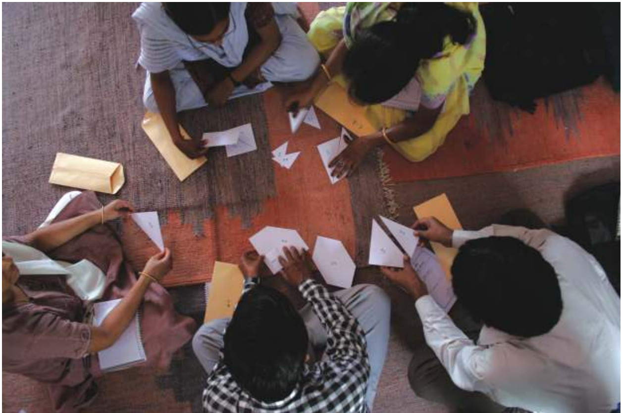
Innovative teaching methods in practice