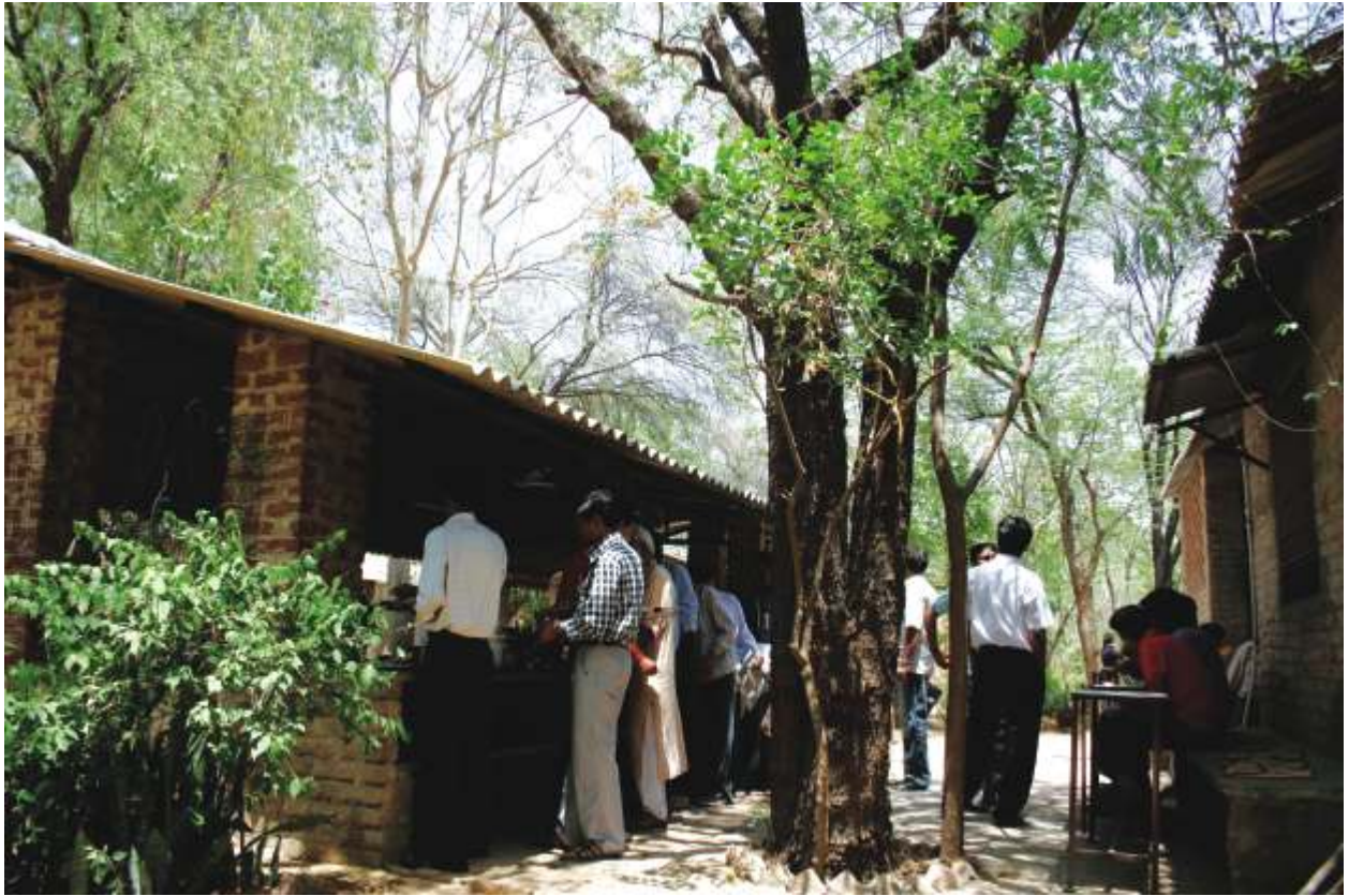
Interacting with other participants at the training workshop