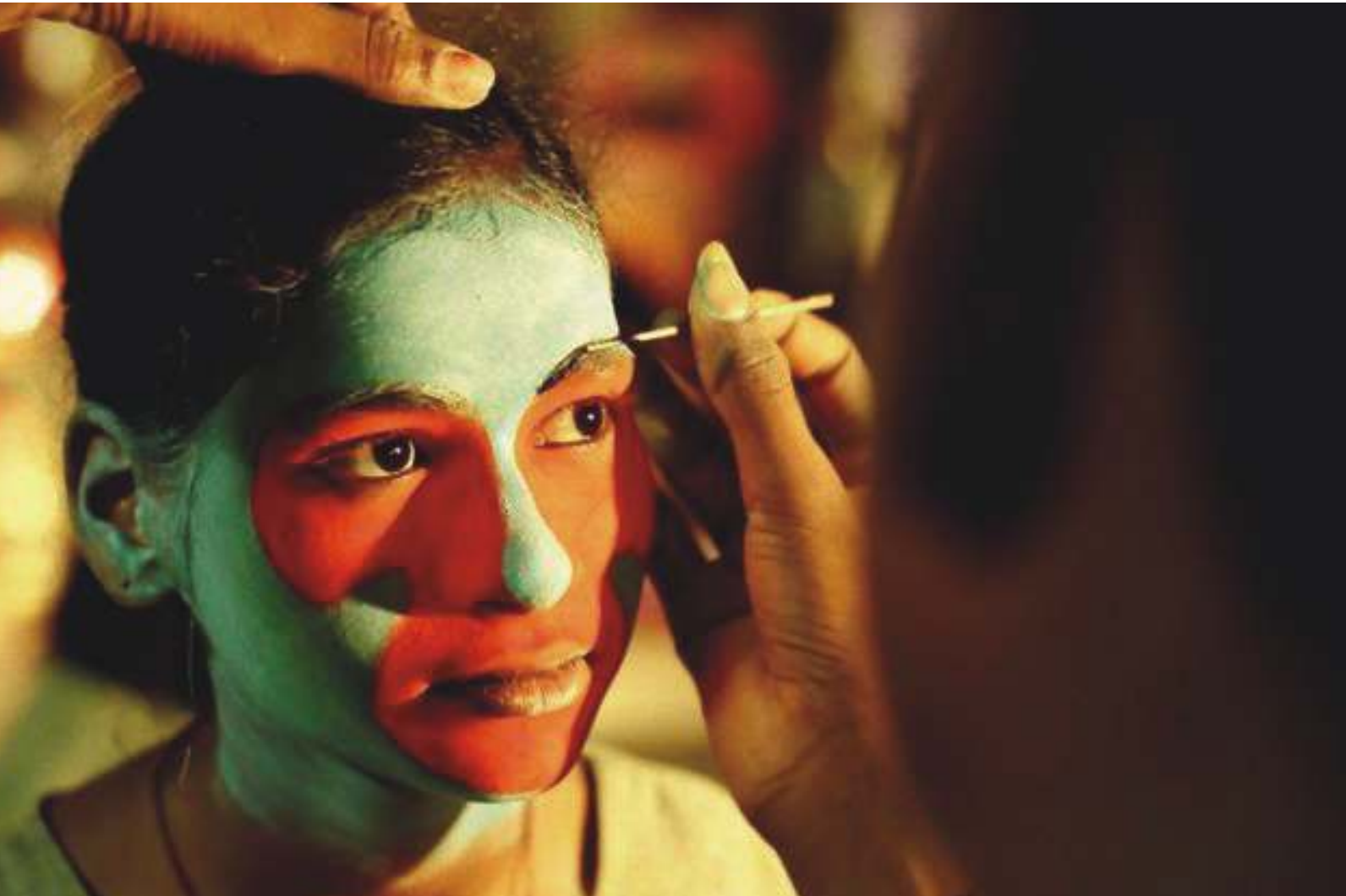
Applying make-up for a forthcoming performance