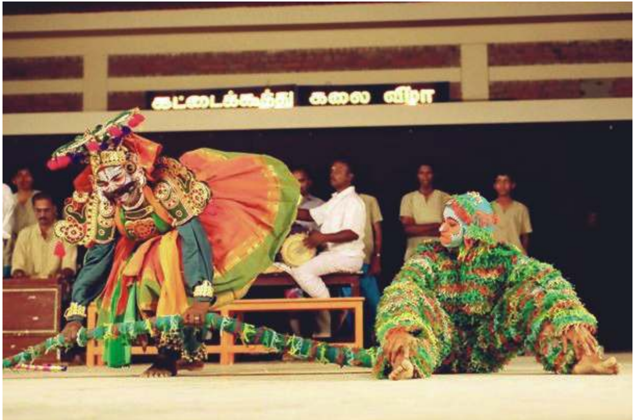
The All-Girls Company performs Mandara Pu — Bhima and the Mandara Flower