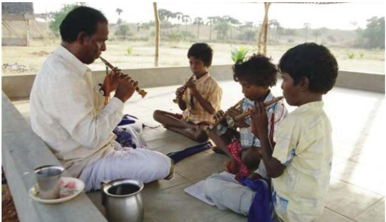
Young students learn the Mukavinai — a rare wind instrument

A grant of Rs 11.00 million was sanctioned in 2005-2006, from the JRD Tata Trust, for four years.