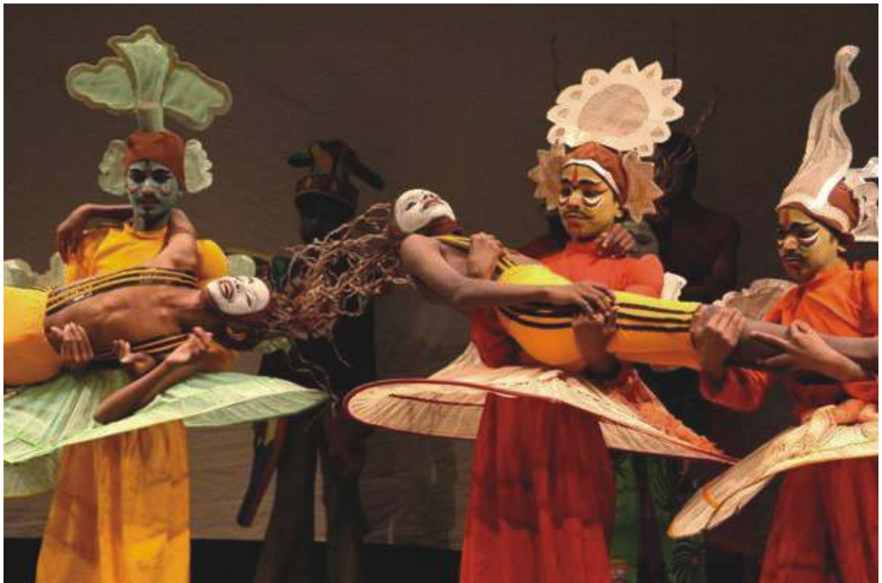
Scene from one of the 'modern' plays, Parkadal — The Milky Ocean