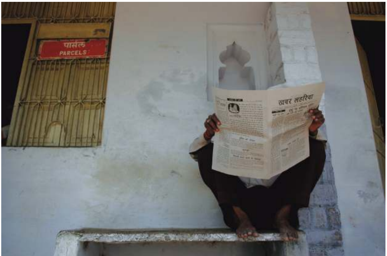
Reading the newspaper is an integral activity of the village community