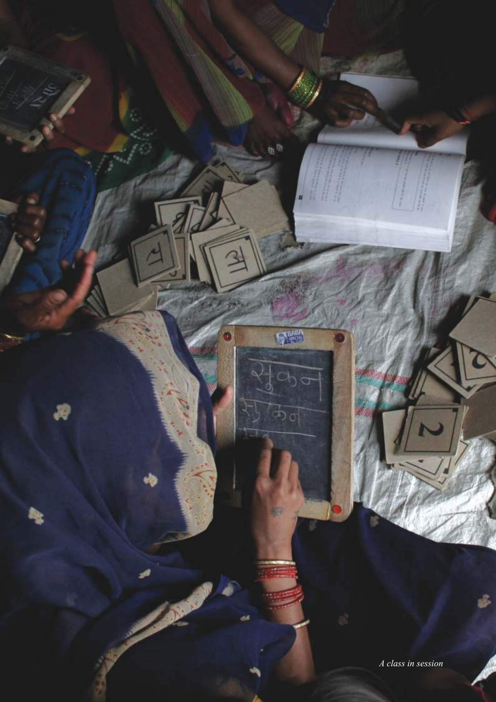
A class in session