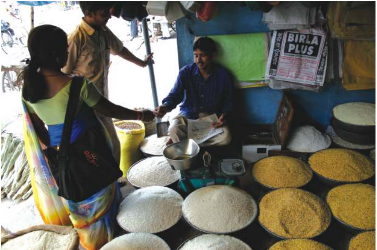
Distributing Khabar Lahariya in the village