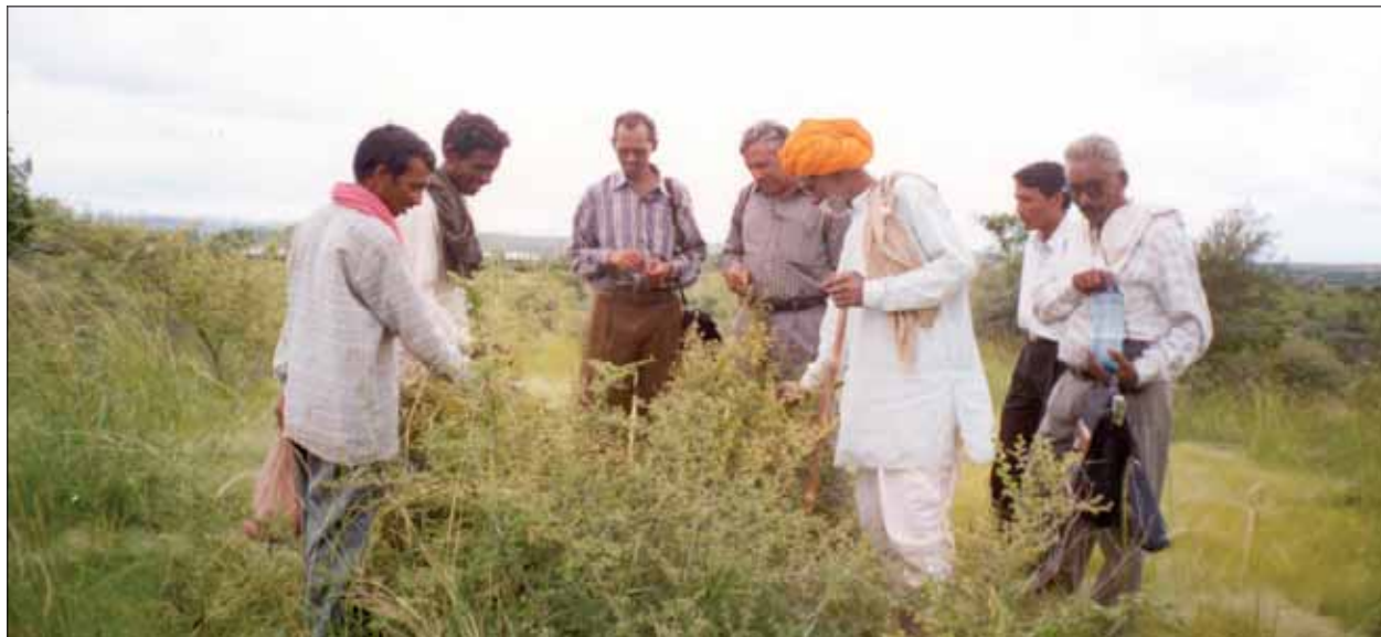
Figure 4. Villagers participating in PBA.

Once the farmers responded to the questionnaire, they were taken around the block assigned to the team (Fig. 4). The team spent over 4 hours going around the area, listing the names of herbs, shrubs and grasses and their uses. The details of the participatory survey are provided in Appendix 2. Besides this exercise, a group led by an ecologist carried out an independent assessment of the biodiversity assessment.