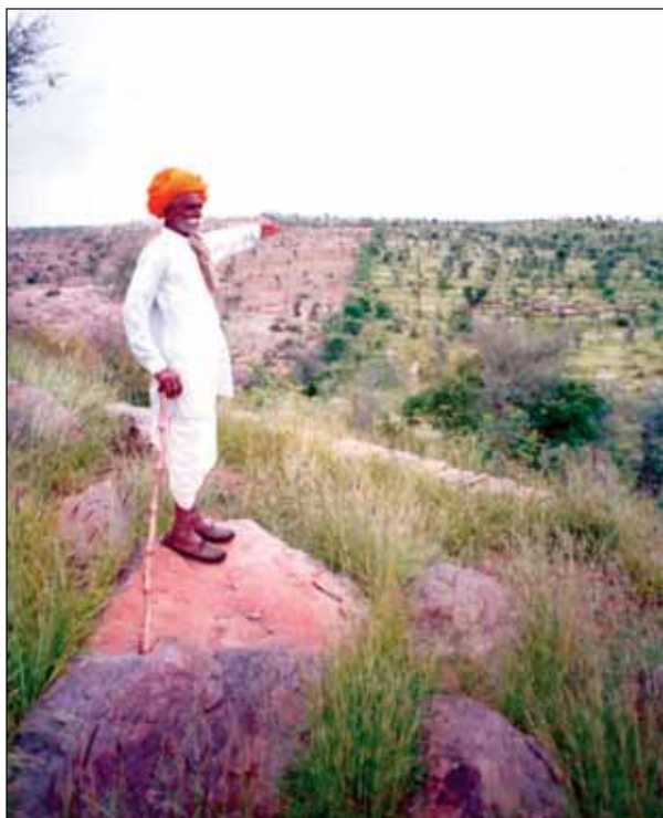
Figure 1. A villager showing the difference in vegetation on either side of the fence.

BAIF Institute of Rural Development, an NGO that is implementing the project here initially recognized the problem and engaged the community to discuss about what could be done to improve the situation. The people reciprocated positively and agreed to part with half of the common grazing area for rehabilitation. The village stakeholder community consisting of grazers, herders and farmers through panchayat , resolved to erect stone fence around the 45-ha grazing land and not allow any cattle to graze in that area. Thus the area was fortified with physical and social fencing. The stakeholders agreed to take up rehabilitation of the grazing land in half the area initially so that the other half was accessible to common grazing. Villagers contributed their labor to erect stone fencing, and construct soil and rainwater conservation structures to arrest runoff and increase infiltration. Over 200 staggered trenches, 290 percolation pits and 6 gully plugs were constructed across the grazing land. Once