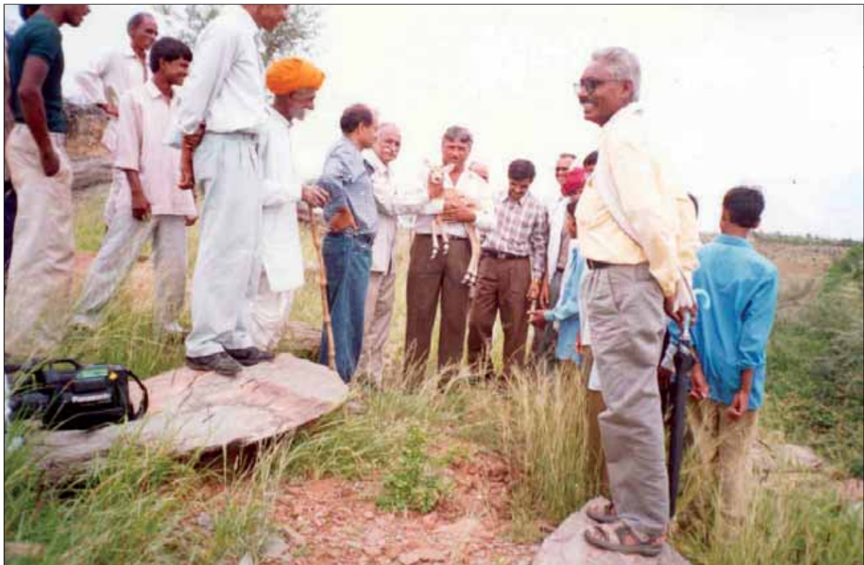
Figure 2. The PBA team with a blue bull calf.

The number of species of useful grasses and fodder has increased tremendously. Besides the flora, even the fauna was rehabilitated in this area. This area is a safe haven for nilgai [a species of wild cows (blue bulls)], adults and young ones. Rabbits, hares, jackals, foxes, mongooses and a host of bird species are found in this area. A biodiversity assessment was undertaken recently with the community participating actively in enumerating and listing the uses of the various herbs, shrubs and grasses that have been rehabilitated in this area (Fig. 2).